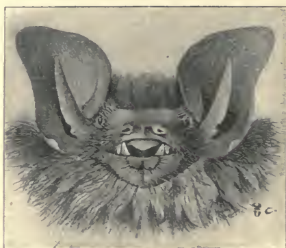
FIG. LXVII. RHOGOESSA TUMIDA. RESTLESS BAT.